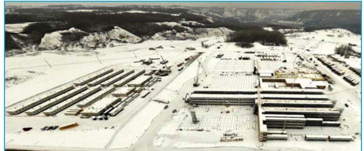
Aerial photo of the worker accommodation lodge, taken February 2016.